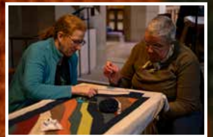
The cover images are examples of the work of the Stitching@Bradford Cathedral group