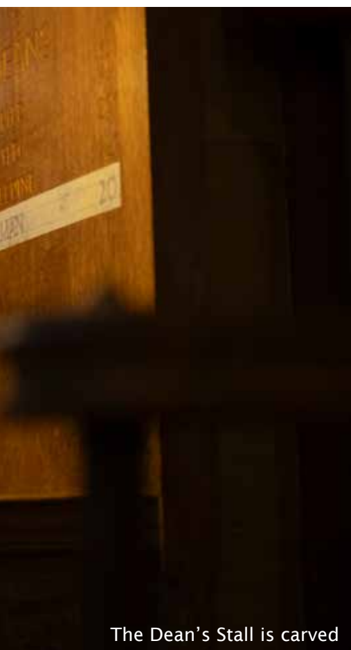
The Dean's Stall is carved

The Visitors' Book and social media record so many lovely comments from people about: the welcome they received; the beauty and peace of the building; its wonderful features, music, services and events.