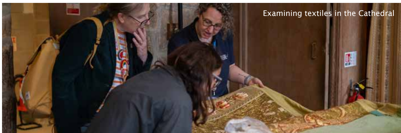
Examining textiles in the Cathedral

We were also grateful to the Cathedral Music Trust for a £15,000 grant in the year, enabling us to employ professional Lay Clerk singers to bolster the choir.