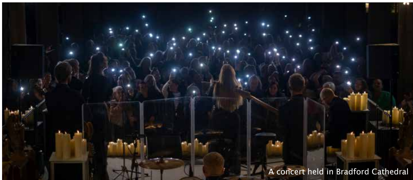
A concert held in Bradford Cathedral

made plans to work towards increasing our membership and activities. We plan to support the children's work in the Cathedral, hold regular coffee mornings for Friends and congregational members, and restart annual outings to other Cathedrals. As ever, our work with the Stitchers continues: we meet alternate Tuesday afternoons and are working on kneelers for the Lady Chapel.